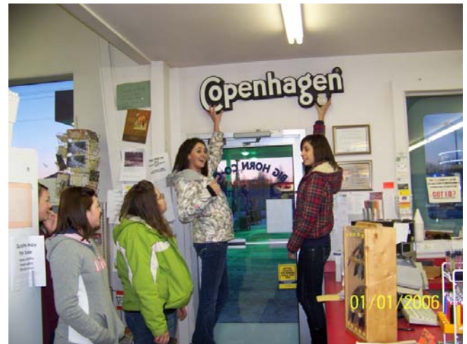
Riverton CAN girls tearing down tobacco advertisements

The tobacco industry spends more than $19.5million in Wyoming yearly promoting a product that kills. ( www.tobaccofreekids.org )